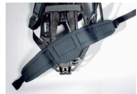
Swivelling Hip Pad Plate Upgrade, set for AirGo SCBA (10089276)