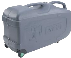
Carrying Case for all SCBA with 1 or 2 cylinders (10049021)