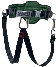
alphaBELT Pro Holding & Rescue Belt (10151246) alphaBELT Basic Holding Belt w/o Lanyard (10151241) alphaBELT Lanyard (10151242) Tri-Lock Carabiner, steel (10157585)