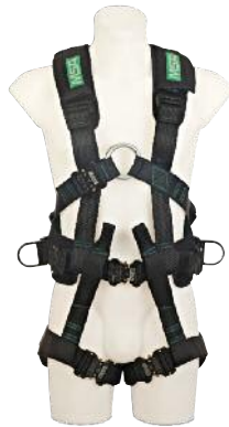
alphaFP pro, standard (10116541) alphaFP pro, large (10117573)