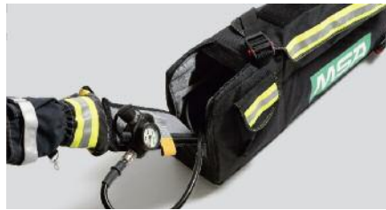
Bag for Rapid Intervention Team SL (10103749) Bag for Rapid Intervention Team SL long (10104597) Bag for Rapid Intervention Team SL-Q (10104598)