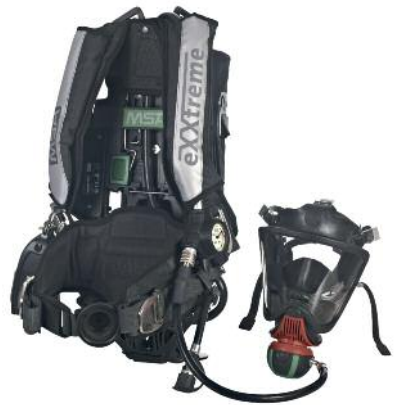
eXXtreme Upgrade Kit, black (10145843) (incl. stainless steel cylinder retaining clamp)