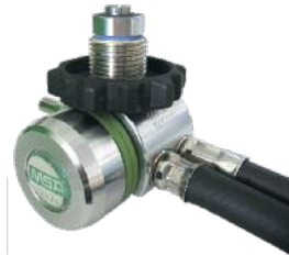
Pressure Reducer Classic , without lines (10068762)

The Classic pneumatic system uses individual lines for each function. One medium pressure line to supply the demand valve and a high pressure line with gauge come as standard.