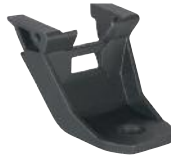
Valve Protection AirGo for 1 cylinder (10145942)