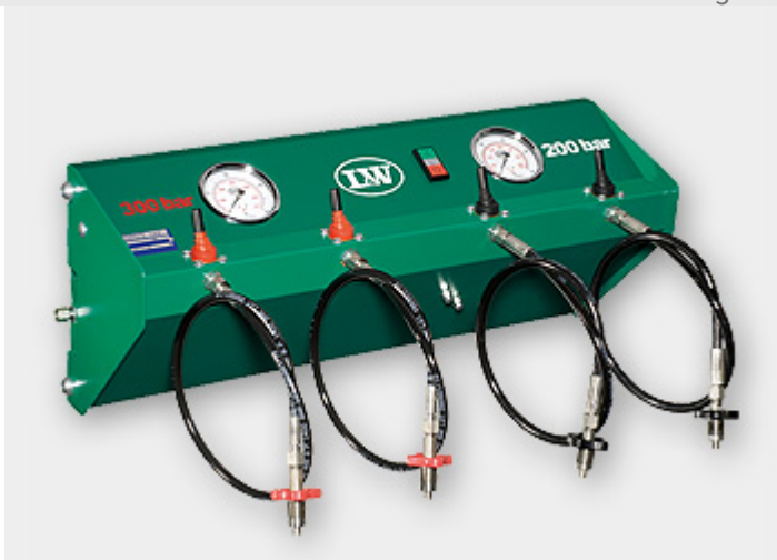
4 point panel - 2 x 200 bar, 2 x 300 bar with hoses and DIN anti-whip connections