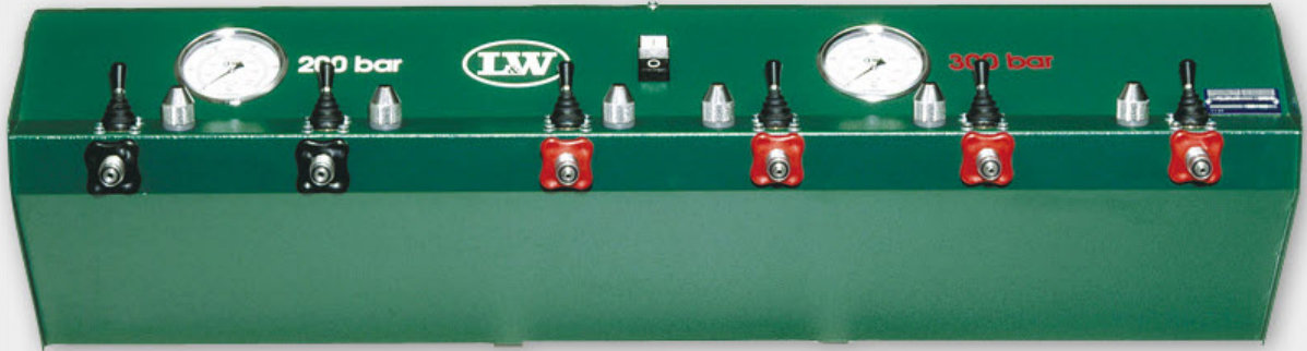
6 point panel - 2x200, 4x300 bar direct BA connections