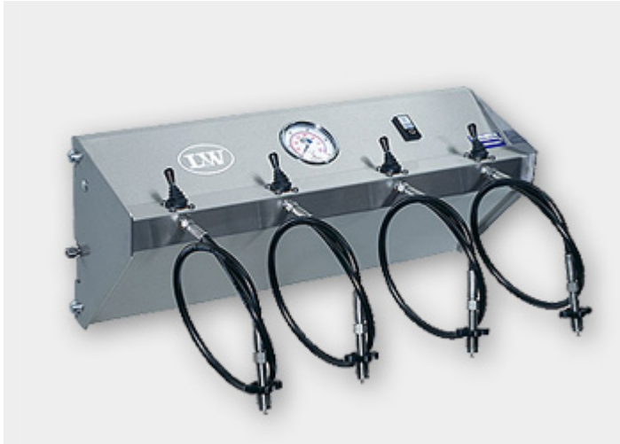
Stainless Steel Filling Panels